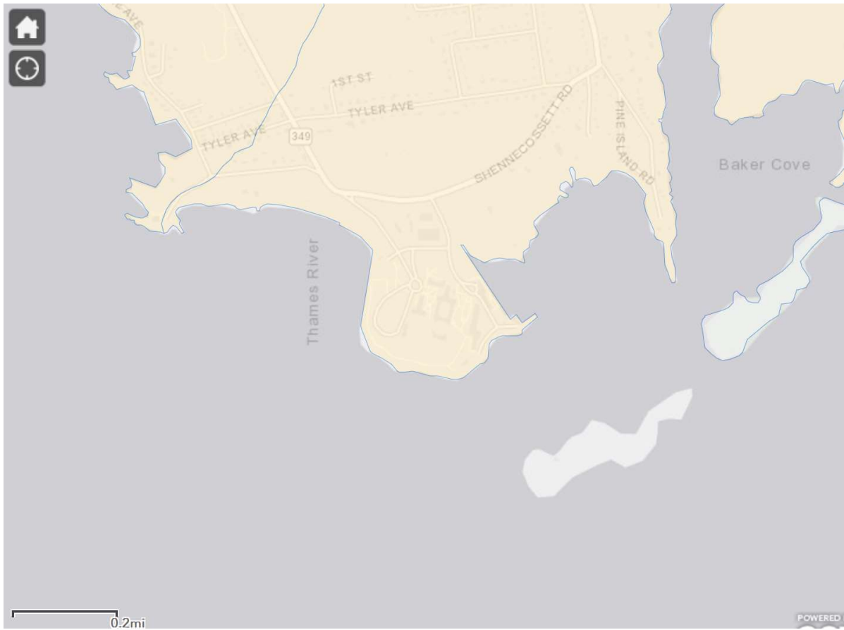
Figure 1-1. Urbanized Areas (basins with impervious cover >11% are shaded yellow) and Other Areas Potentially Subject to the MS4 Permit IDDE Program Requirements (“Priority Areas”).